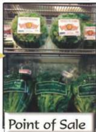
Point of Sale